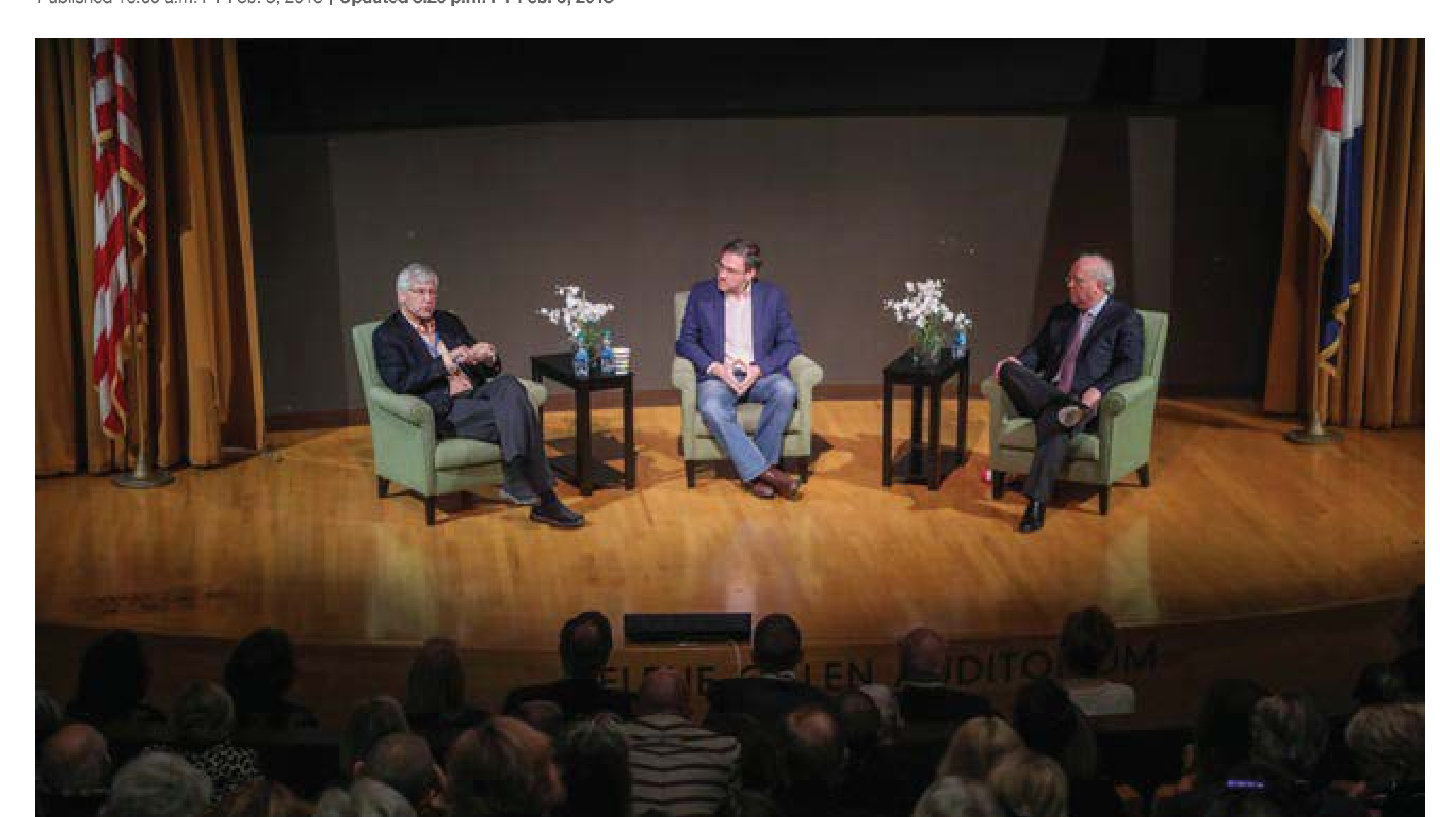
The 5th Annual Rancho Mirage Writer's Festival "Angels Only" opening night dinner was held at The Helene Galen